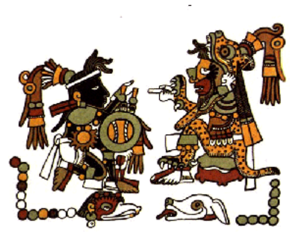
8-Deer, Mixtec Leader